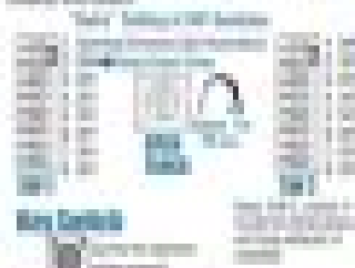
TABLE 1. Continued – (Contd.) Ability for suboptimal-risk HC (continued)