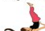
SHOULDER STAND Le Chandelle