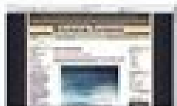
View on Online

3000 Locust St.(Side Entrance) Philadelphia, PA, 19104 Tel: 215.382.3382 Fax: 215.382.3392 Email: order@authenticstatements.com www.authenticstatements.com