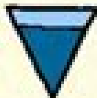
The Inverted Pyramid Newspaper Article